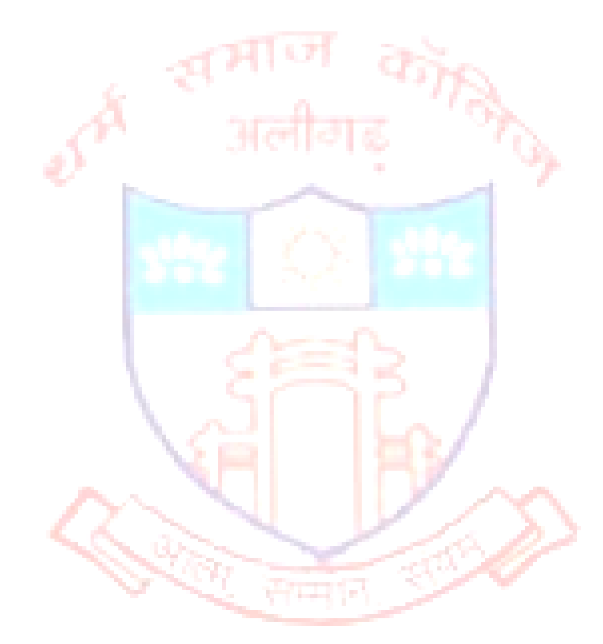
BVoc-IT-G-503: MANAGEMENT INFORMATION SYSTEM